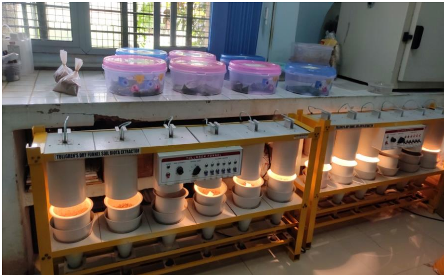
Plate 2: Setting of Berlese Funnel for the Estimation of Soil Invertebrate population from collected samples