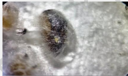
Pupa is ready to emerge