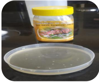
1. Preparing honey solution