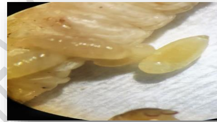
Late instars of Bracon