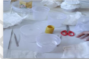
3. Take a wide mouthed jar