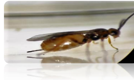
Adult of Bracon