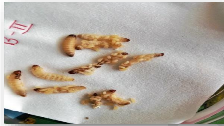
Early instars of Bracon