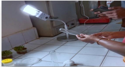
4. Release 20 Bracon adults to the jar near light source as they are phototropic in nature