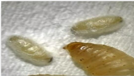
Pupa of Bracon