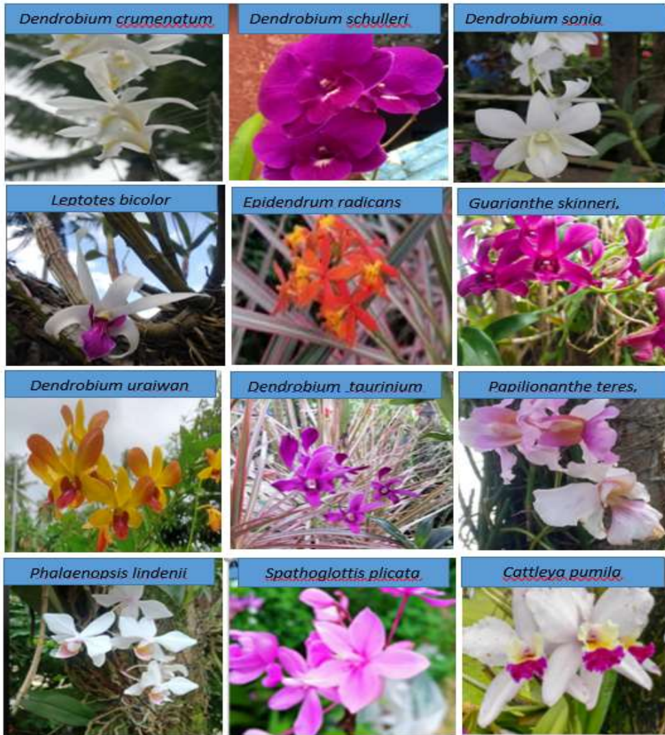
Figure 1. Selected Orchid Species found in Northern Samar

Commented [h84]: Change: The photographic representation of selected Orchid species found in the natural habitats of Northern Samar