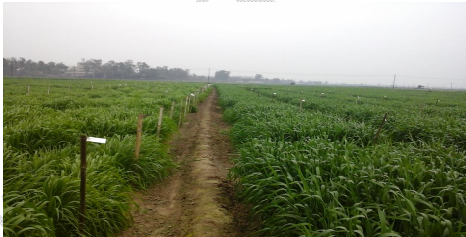
Fig. 1 Field evaluation of combi-fungicides for the management of wheat leaf rust during the Rabi season of 2022-23"

The field experiment was undertaken at Wheat Pathology Block, Norman E. Borlaug Research Centre of G.B.P.U.A &T, Pantnagar (Uttarakhand) during Rabi season of 2022-23 to assess the effectiveness of several combination fungicides against leaf rust of wheat. Susceptible wheat variety PBW 343 was used and experiment was conducted following the recommended agronomic practises under irrigated conditions in randomized block design with ten treatments replicated thrice (Table 1).