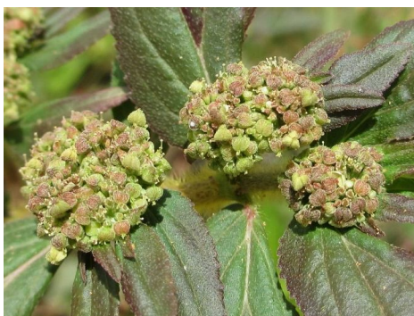
Figure 1: Euphorbia hirta

In West Africa, Euphorbia hirta is used as a galactagogue to promote milk production in lactating women. The plant is also employed as an anthelmintic to expel intestinal worms and as a diuretic to increase urine output. In Nigeria, the plant is used to treat diabetes, hypertension, and various infections, reflecting its broad spectrum of medicinal applications. [8,9,10]