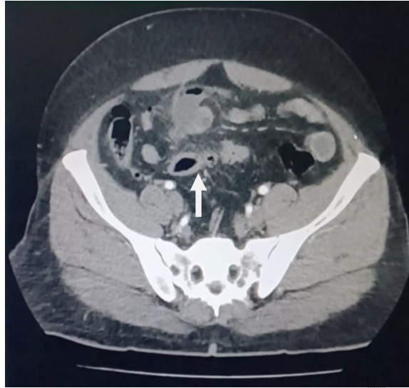
FIGURE 3: Contrast enhanced computed tomography (CECT) of the abdomen and pelvis showing thick walled collection surrounding the sigmoid colon.