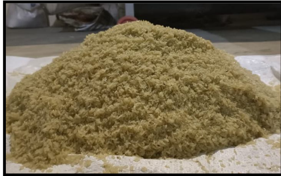
Plate 2. Conditioned rice (IR-64)