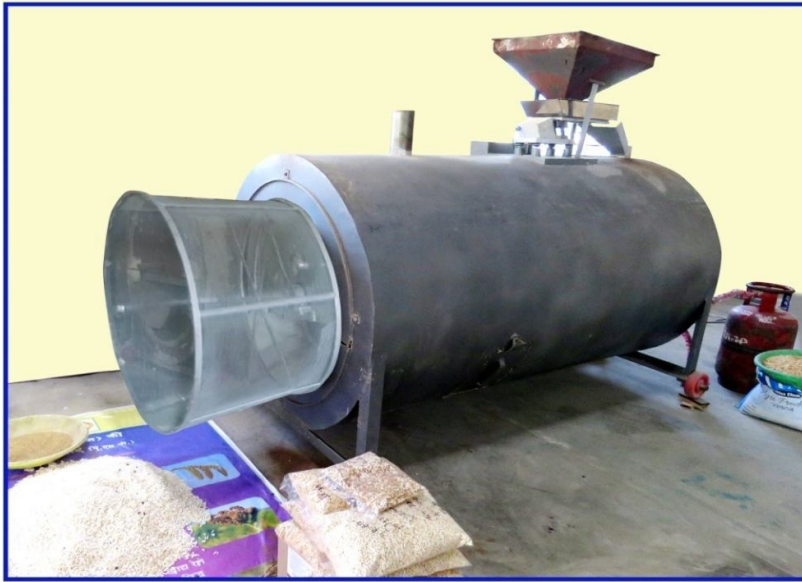
Plate 1. Rice puffing machine developed by IGKV Raipur