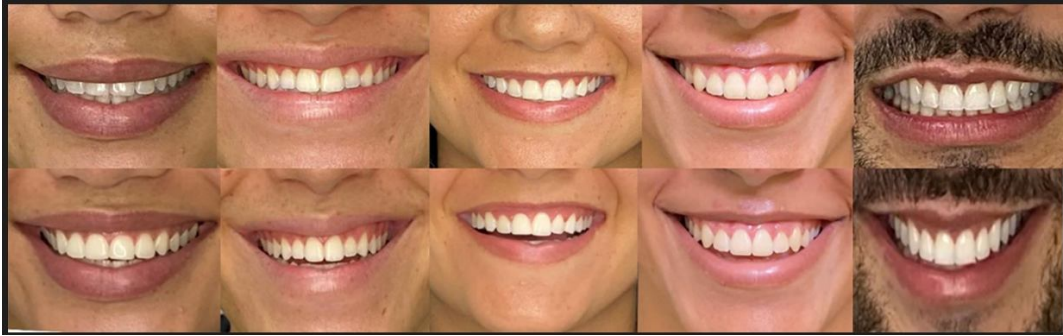
Figure 1: Posed and spontaneous smiles