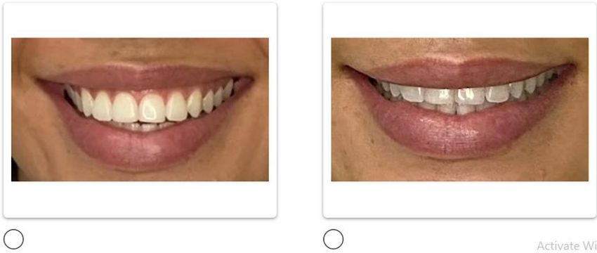
Figure 4: Comparison between posed and spontaneous smile

Among the smiles below, choose the one you find most attractive