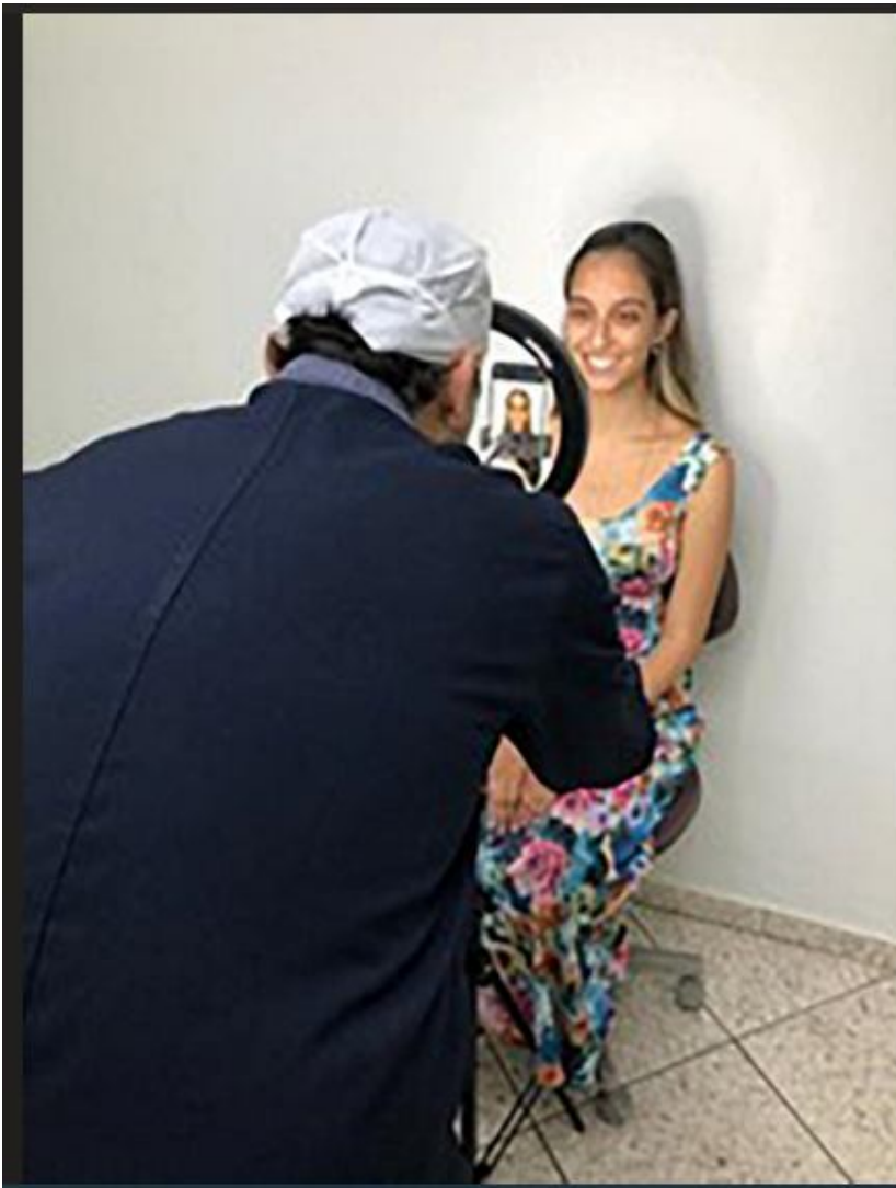
Figure 2: Positioning for recording images