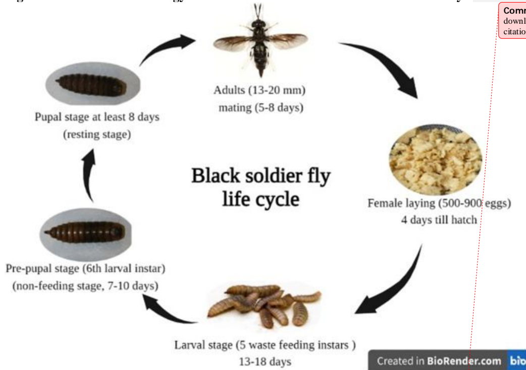
Figure 1. Biology of black soldier fly

Comment [U3]: Is this figure is self drawn or downloaded? If downloaded then please give proper citation.