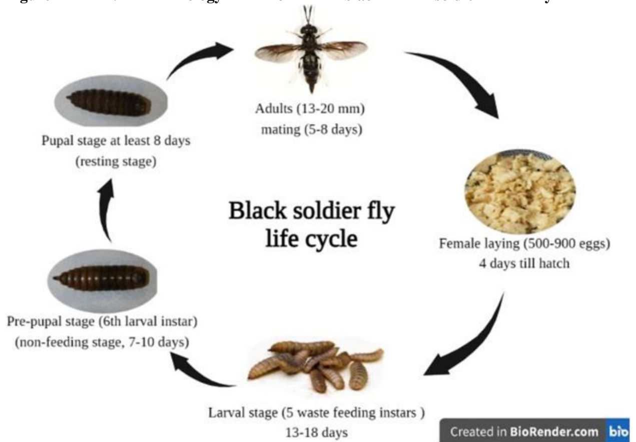
Figure 1. Biology of black soldier fly

the food substrate [16]. The life cycle last approximate 45 days [Egg (4 days), Larva(18 days), Pupa (14 days), and adult (9 days)]. The total life cycle of BSF completes about 45 days but may extend up to four months [19] depending upon composition of food substrate, temperature, humidity etc.