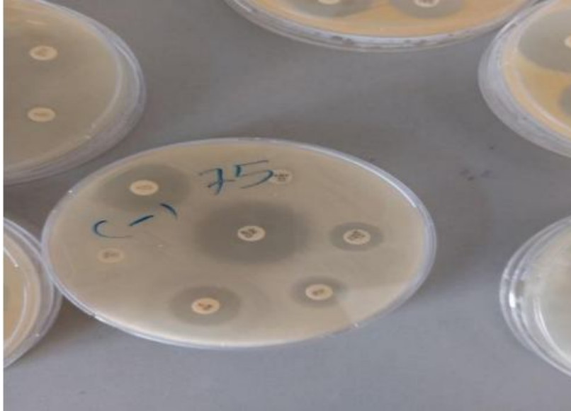
Figure 3: Antibiotic sensitivity test (Zone of inhibition)