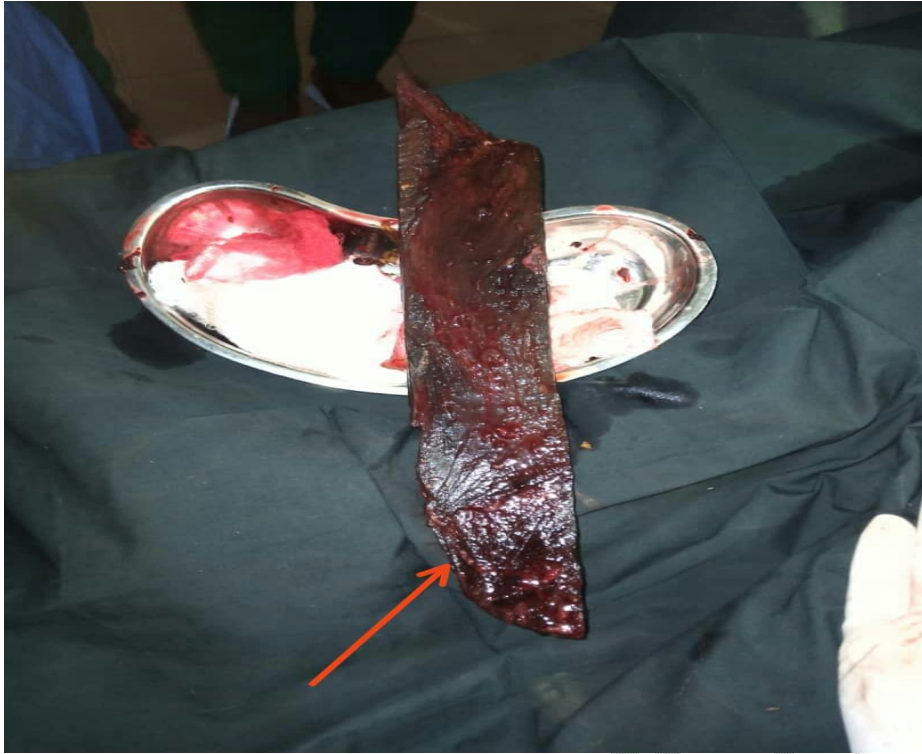
FIGURE 2: ARROW SHOWS THE PIECE OF WOOD THAT PIERCED ABDOMINAL WALL AND VISCERA