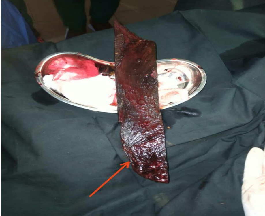
FIGURE 2: ARROW SHOWS THE PIECE OF WOOD THAT PIERCED ABDOMINAL WALL AND VISCERA