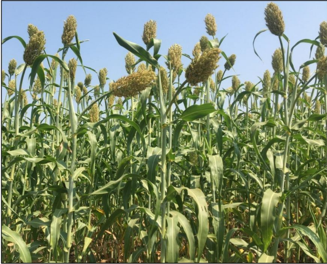
Field view of SVT 55 (SPV 2644)