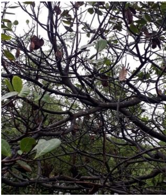
Fig 1. Field symptoms

similar. A comparison of the culture of the pathogen obtained in isolation and re-isolation revealed the same fungus.