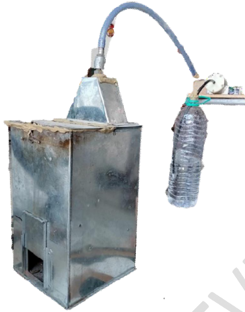
Figure 1. Preparation of Somke water chamber