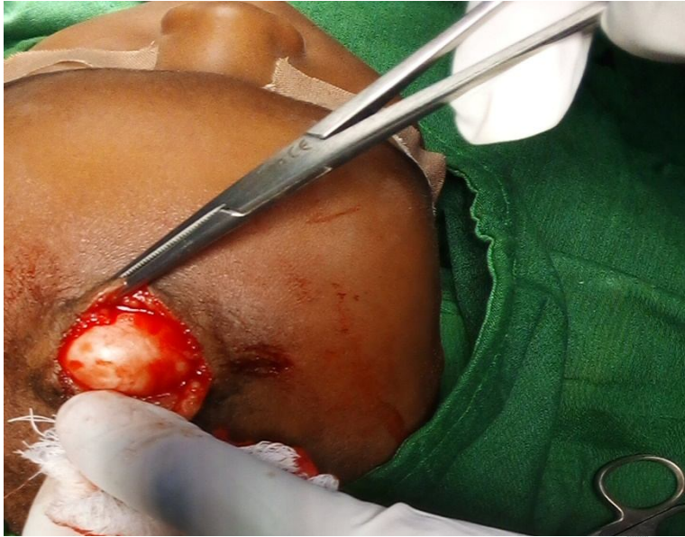
Fig.3B. intra – operative picture