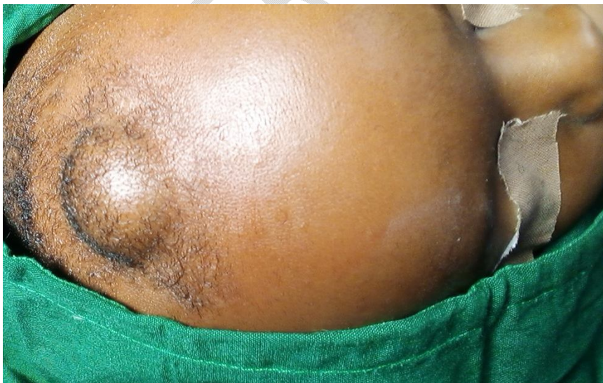
FIG. 3 A. intra – operative picture (before incision)