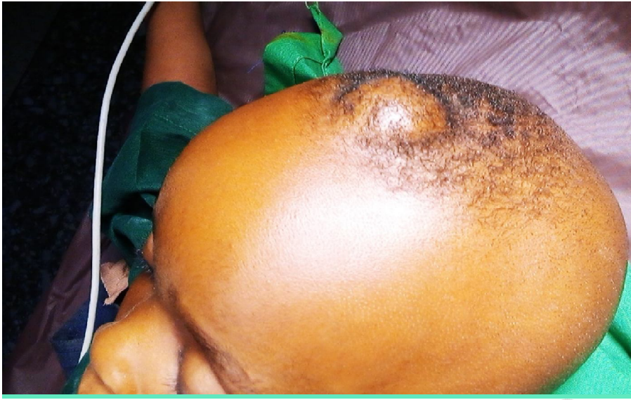
FIG. 2. Pre- operative picture