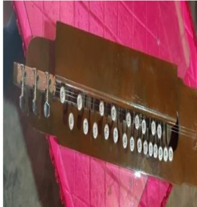
Figure 2. Mandoliong Ulu Framme

In the ulu Mandoliongis a block that looks like a semicircle. In this section there are 5 string players installed in an upright position. This wire player is a place to install one end of the string stretch. This string player serves to adjust the high and low tone of the Mandoliong string. The head is semicircular with a width of 8 cm in length, 8 cm (the very edge is curved with a radius of 8cm), and 4 cm high. There are 5 standing wire players with a length of 4 cm and a diameter of 5 mm. The installation of the wire guide consists of two stacks, the first arrangement consists of three wire players installed at a distance of 4 cm from the boundary between the Mandoliong and ulu Mandoliong characters and the second arrangement consists of two string players installed at a distance of 6 cm from the boundary between the Mandoliong and ulu Mandoliong characters. The wire player installation is installed by alternating intervals.