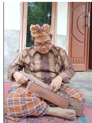
Figure 1. Sitting on a chair

Currently, the performance form of Mandoliong musical instruments has also changed in Mandoliong players. The change that occurs is the position of the Mandoliong player when playing Mandoliong . At first, Mandoliong was played by flooring with a massulekk sitting position (in Bugis language) which means sitting cross-legged. Then Mandoliong is placed on the right foot by way of iriwa (in Bugis language) which means on the lap. The position of placing the Mandoliong must also be controlled on the body of the Mandoliong . Especially in the lower resonance hole. The position of the Mandoliong must be precise so that the sound coming out of the lower resonance hole can come out. It is currently changing for reasons of playing aesthetics and ethics to change the position of playing Mandoliong musical instruments . The ethics in question is the position of the player when playing in an ensemble (collaborative music). According to Kurdia, who is a player of the Mandoliong musical instrument in an interview conducted on April 29, 2012, explained that there are two positions to play the Mandoliong instrument, namely by sitting cross-legged and by sitting on a chair on his lap .