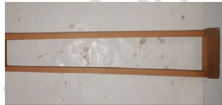
Figure 4. Mandoliong Watang Frame

hammers. The second part is the watang Mandoliong frame made of wooden blocks measuring 56 cm long, 1 cm wide and 4 cm high. The end of the Watang Mandoliong frame has a length of 12 cm, a width of 3 cm, and a height of 4 cm. The process of making the frame of the Mandoliong watang using sawing tools, and kattams. The shape of the Mandoliong watang frame is as shown below: