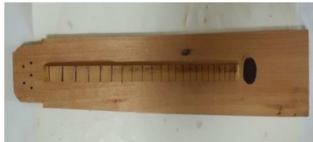
Figure 5. Mandoliong Box Board (Soundboard)

The next process is to make the Mandoliong frame cover board. Making watangMandoliong cover is done by binding boards measuring 100 cm long, 15 cm wide and 1 cm high. This board is thinly attached. Watang board thickness Keres Mandoliong and punch holes in the board to make lower and upper resonance holes Mandoliong . Part Ulu Mandoliong dotted for the sign where to install the wire player Mandoliong . The shape of the board that has been attached, has a thickness of 3 mm, fitted with keres , and given a point for where to install the Mandoliong player as shown below: