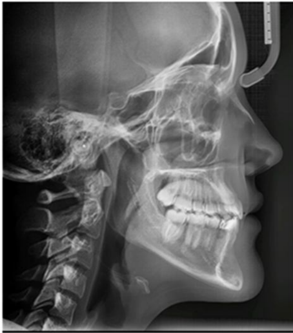
FIGURE 4. Post-treatment panoramic and cephalometric tracing.