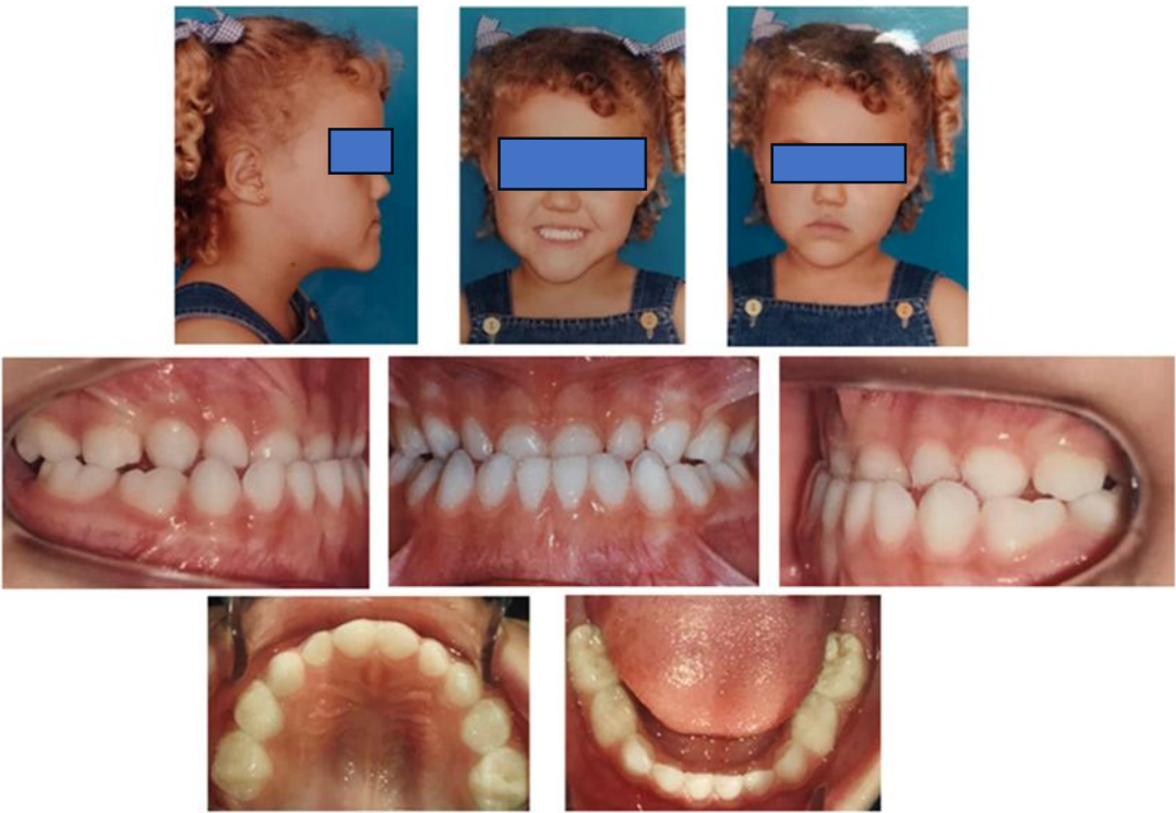
FIGURE 1. Pre-treatment facial and intraoral photographs.