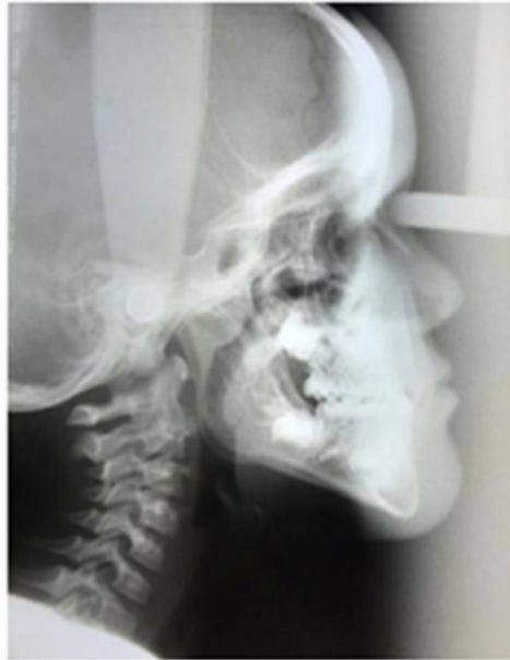
FIGURE 2. Pre-treatment panoramic and cephalometric tracing.