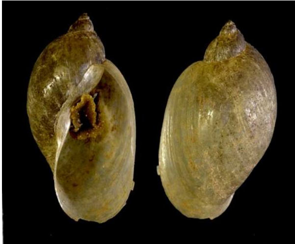
Figure 2: Lymnaea spp