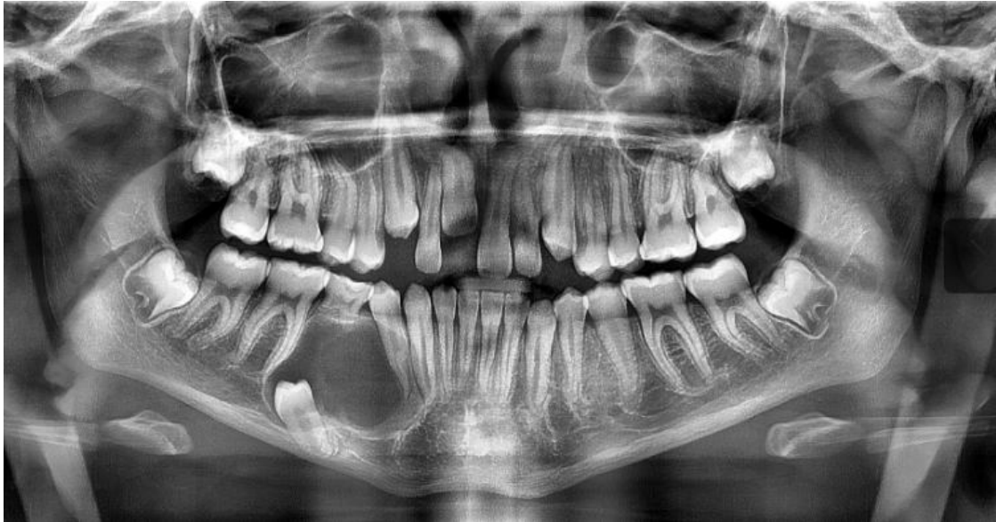
Figure 02: initial panoramic x-rays