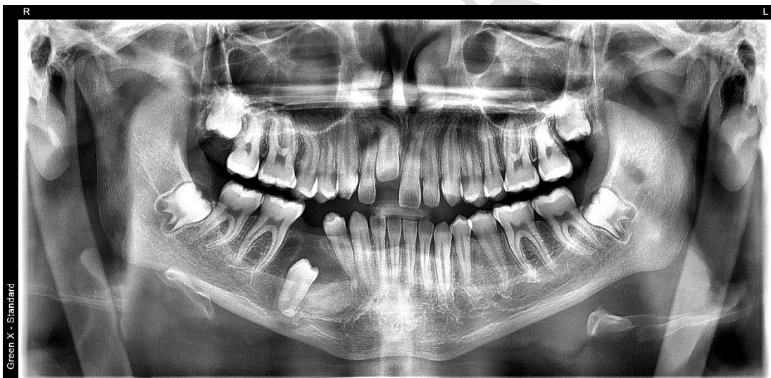
Figure 03: panoramic x-rays after 8 months, already with the decompression technique