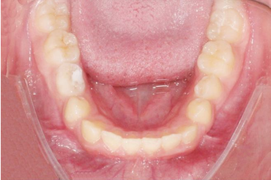
Figure 01: intraoral photos demonstrating no changes on clinical examination

Histopathological analysis confirmed the diagnosis of odontogenic keratocyst. The patient returned for follow-up every 30 days, with new radiographic exams every 60 days for monitoring.