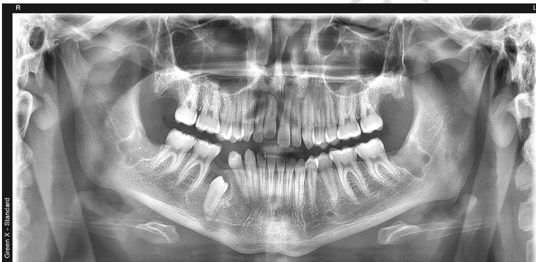
Figure 05: panoramic x-rays after 18 months