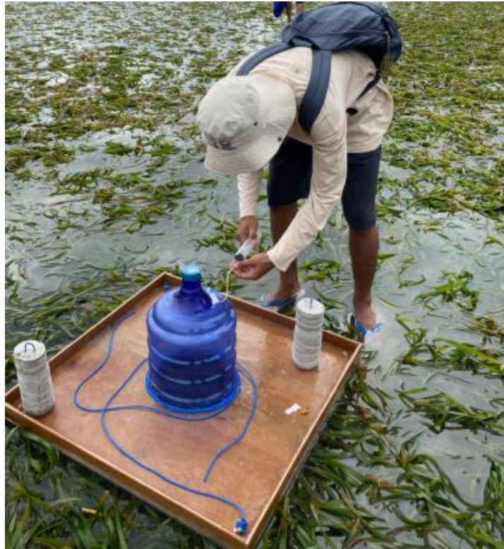
Figure 3. Gas Sampling via Syringe in the Rh-Chamber in the Seagrass Sedimentary Area