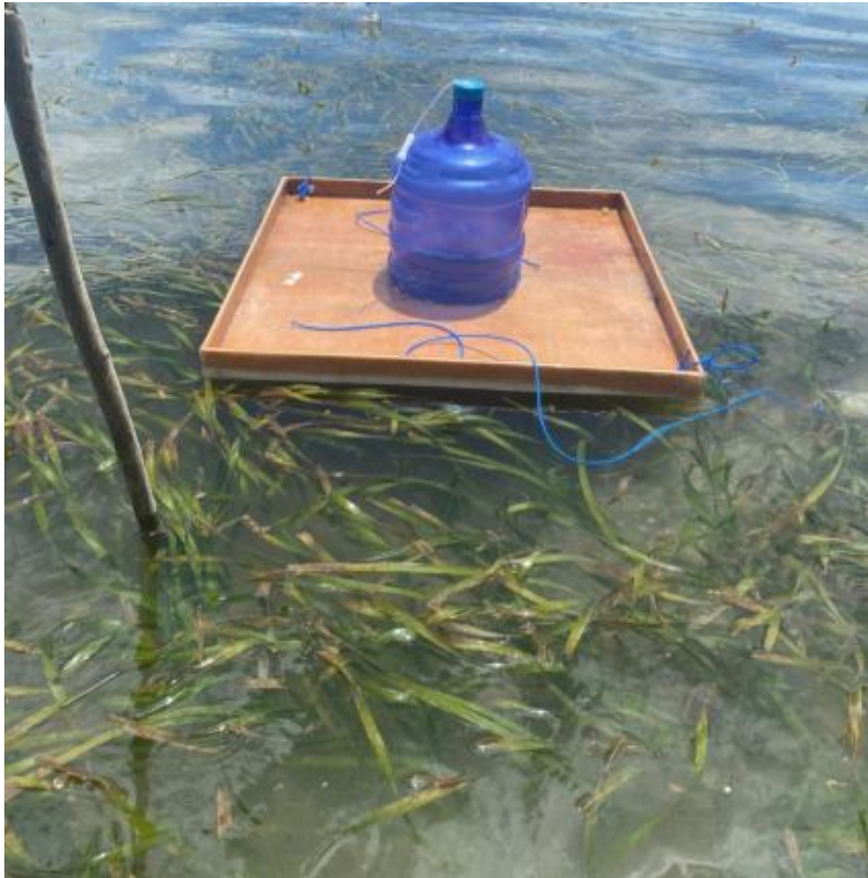
Figure 4. Operational Placement of Rh-Chamber for Gas Sampling on the Surface of Seagrass Waters