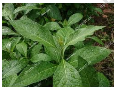
Figure 1: An image of Vernonia amygdalina (Bitter leaf)

The plant is scientifically classified as belonging to the Kingdom Plantae. It is an angiosperm, of the order Asterales, of the family Asteraceae, genus Vernonia , and species V. amygdalina . The full binomial name is Vernonia amygdalina Del [4].