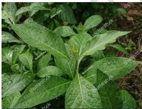
Figure 1: An image of Vernonia amygdalina (Bitter leaf)

The plant is scientifically classified as belonging to the Kingdom Plantae. It is an angiosperm, of the order Asterales, of the family Asteraceae, genus Vernonia , and species V. amygdalina . The full binomial name is Vernonia amygdalina Del [4].