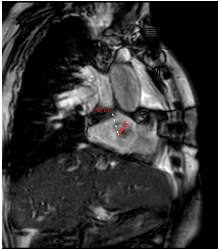
Fig.2. Cardiac MRI image showing a thrombus in the right atrium attached to the inferior vena cava by its appendage.