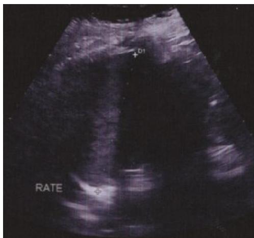
Figure 1 ultrasonographic appearance of a primary splenic hydatid cyst