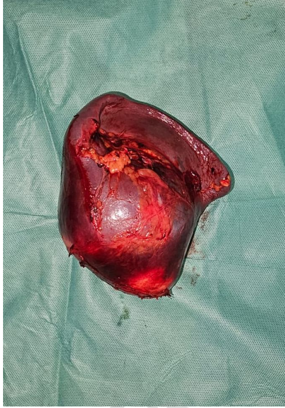
Figure 4 splenectomy specimen: posterior surface