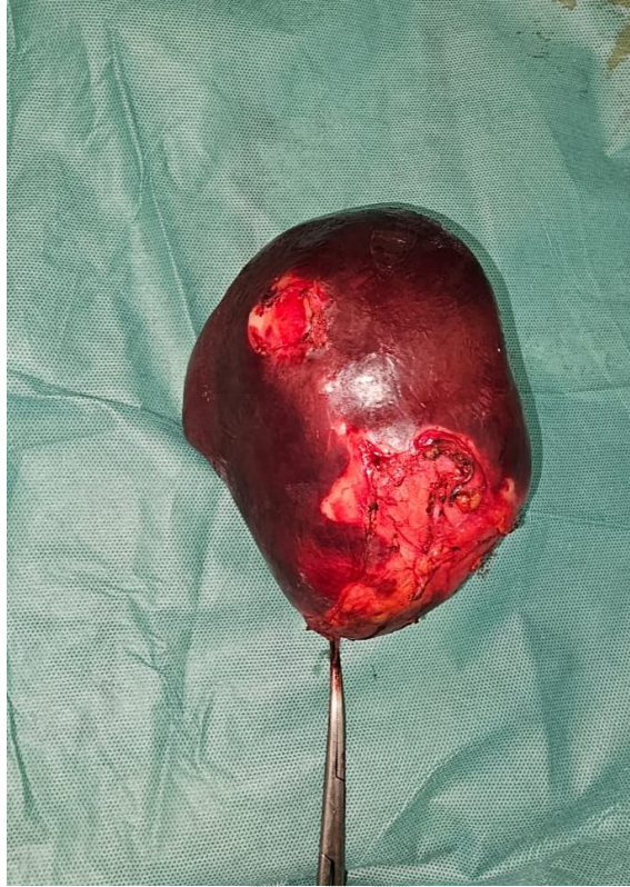
Figure 3 splenectomy specimen: anterior surface