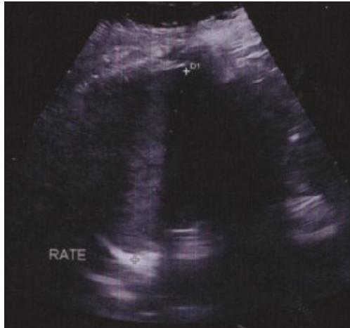
Figure 1 ultrasonographic appearance of a primary splenic hydatid cyst