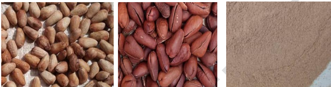
Figure 2: Dried, dehulled, and ground seeds of C. cordifolia