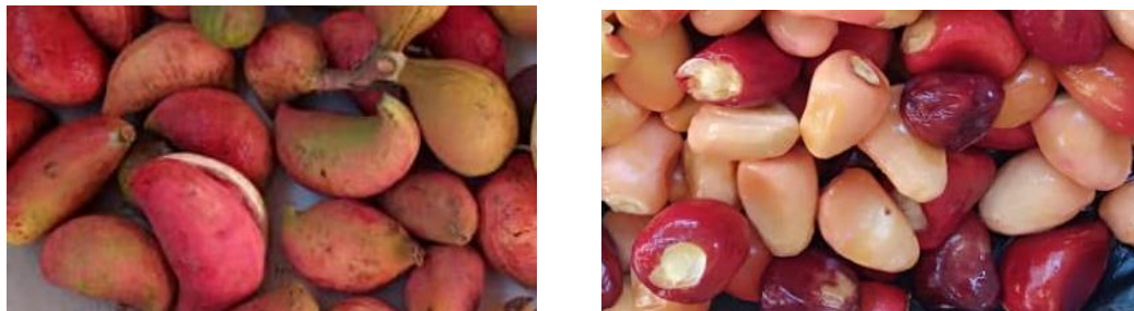
Figure 1: Cola cordifolia Fruits and Seeds

Biological material used in this study consists of Cola cordifolia fruits collected from the botanical garden of the Université Peleforo Gon Coulibaly in Korhogo.