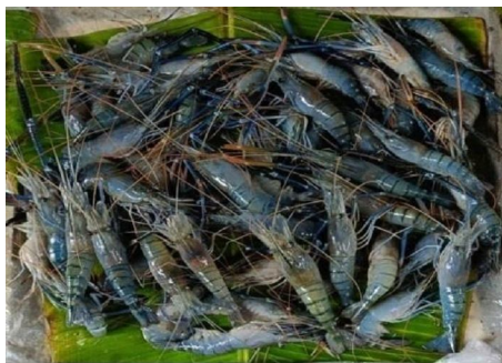
Fig: 6 M. rosenbergi

It is also a freshwater shrimp. It is found in Rupnarayan River. The colour of this species is slightly brownish. Thin hairy coverage found over the body (24).