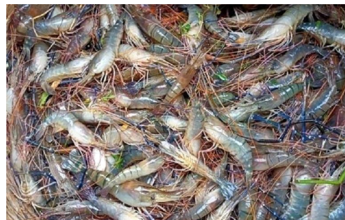
Fig: 7 M. brevicornis and M. monoceros