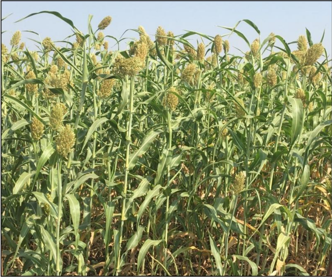
Field view of SVT 68 (SPV 2551)