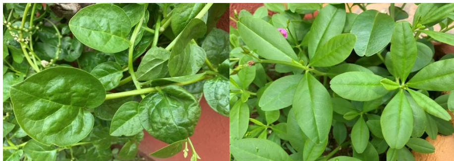
Malabar spinach ( Basella alba )

Research Unit of Agronomy Department, Ladok Akintola University of Technology, Ogbomosho for identification.