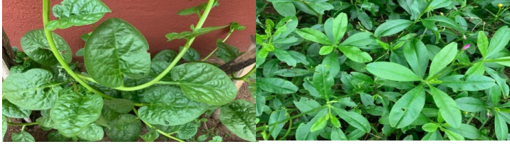
Figure 1a: Malabar spinach ( Basella alba ) Figure 1b: Water leaf ( Talinum triangulare )