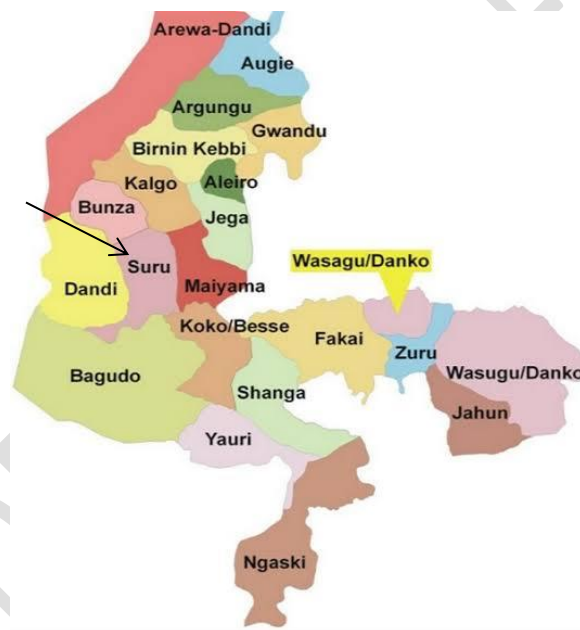
Fig 1: Map of Kebbi State showing the study area. Source [8]

The LGA has a mean annual temperature of 21 0 C - 38 0 C, though it sometimes fluctuates. The highest temperatures are recorded in the months of April and May. The harmamttan season runs through November to February, while the hot season starts from March to April. The mean annual rainfall is about 1000mm [8] the bulk of the rains fall between June and September with an average of 220mm in August. The people of Suru LGA are composed of Hausa, Fulani and Kyangawa ethnic groups. They are renowned farmers, cattle rearers, fishermen and traders. They cultivate crops such as millet, sorghum, rice and cowpea. The area is blessed with abundant fertile lands.