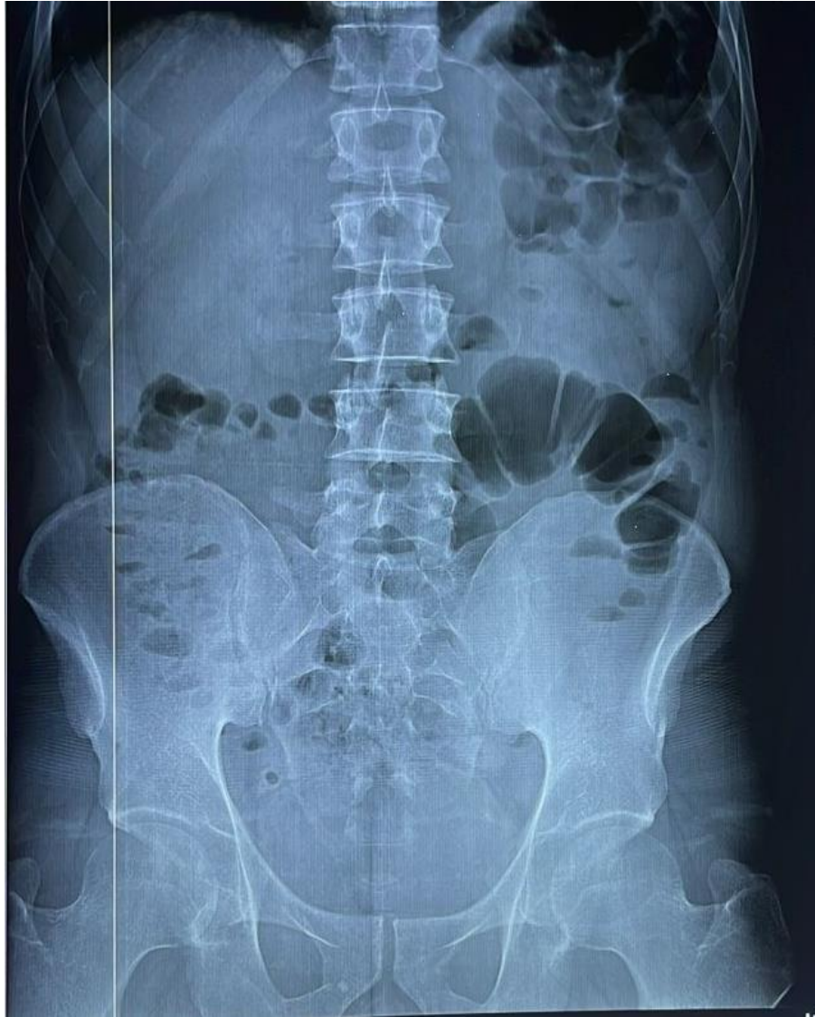
Figure 2 : Abdomino-pelvic X-ray after the use of enema