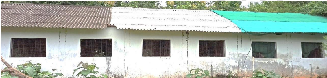
Fig. 1. Outside view of the experimental shed

The existing cow shed was having asbestos roof, brick wall, concrete floor and other recommended specifications like floor space, air space, ventilation etc. It was partitioned into three compartments by raising brick walls, each having the dimension of 30 x 25 ft size. The asbestos roof of first one was covered with 90 % grade green shed-net. Over the asbestos roof of second compartment, heat reflective white colour was painted and asbestos roof of third one was left as such (Fig.1). The ambient temperature and relative humidity of all three sheds and outside the shed were recorded on hourly basis from 8.00 AM to 5.00 PM by help of digital thermometer and hygrometers and the temperature humidity index (THI) was calculated as suggested by Habeeb et al. [1].