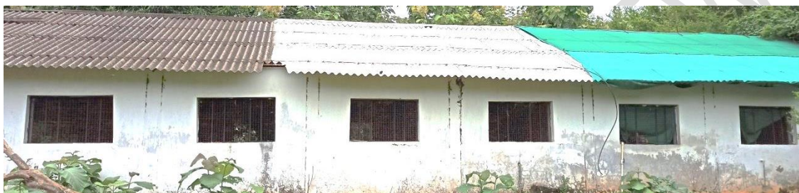
Fig. 1. Outside view of the experimental shed

The existing cow shed was having asbestos roof, brick wall, concrete floor and other recommended specifications like floor space, air space, ventilation etc. It was partitioned into three compartments by raising brick walls, each having the dimension of 30 x 25 ft size. The asbestos roof of first one was covered with 90 % grade green shed-net. Over the asbestos roof of second compartment, heat reflective white colour was painted and asbestos roof of third one was left as such (Fig.1). The ambient temperature and relative humidity of all three sheds and outside the shed were recorded on hourly basis from 8.00 AM to 5.00 PM by help of digital thermometer and hygrometers and the temperature humidity index (THI) was calculated as suggested by Habeeb et al. [1].