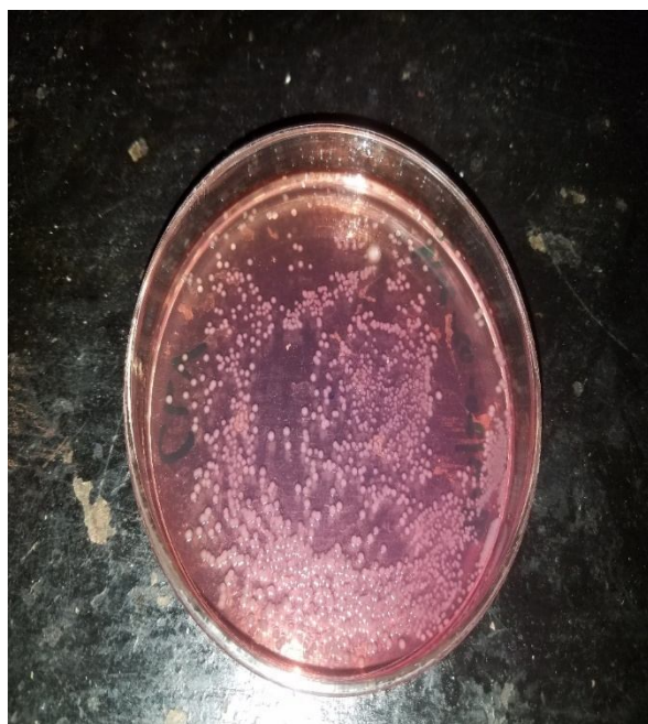
2 A plate showing the growth of bacteria on mannitol salt agar