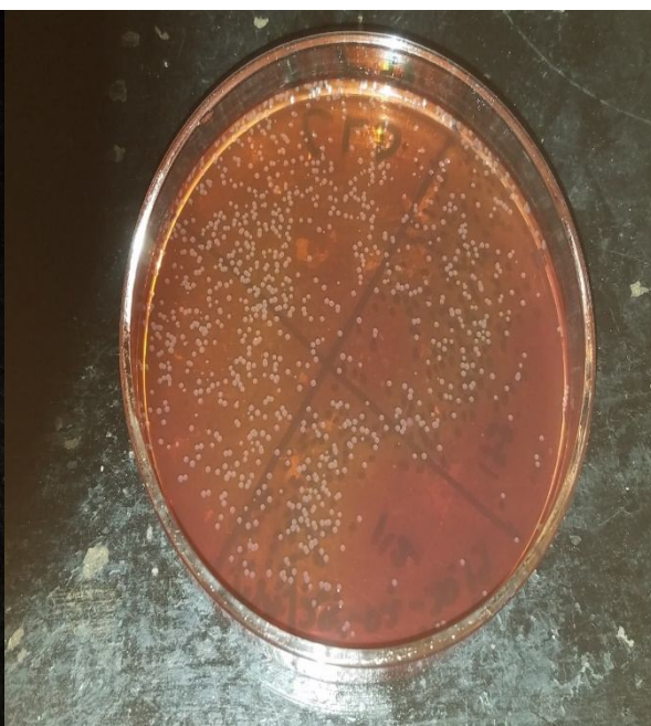
Fig. 3.A plate showing bacterial colonies on MacConkey agar