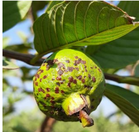
Fig. 1: Symptoms of guava fruit canker