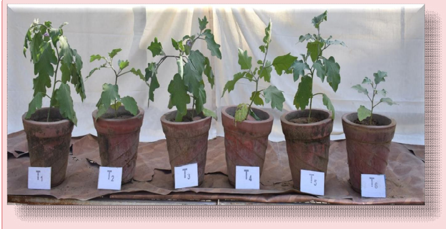
Plate-2: Effect of bio-agents on plant growth and development in brinjal

Commented [MV7]: Edit in a more scientific way of presentation, properly label the plants in the sub title of the figure