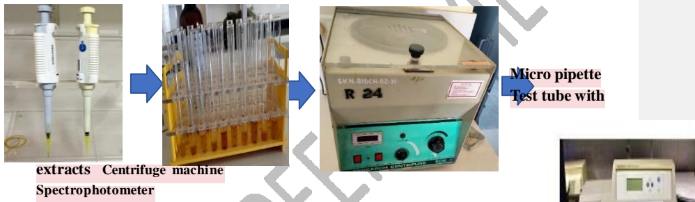
Plate-1: Enzyme analysis process in brinjal roots infected with root- knot nematode

Commented [MV3]: Photographs and flow cahrt for methjodology is not necessary, methods can further be discussed