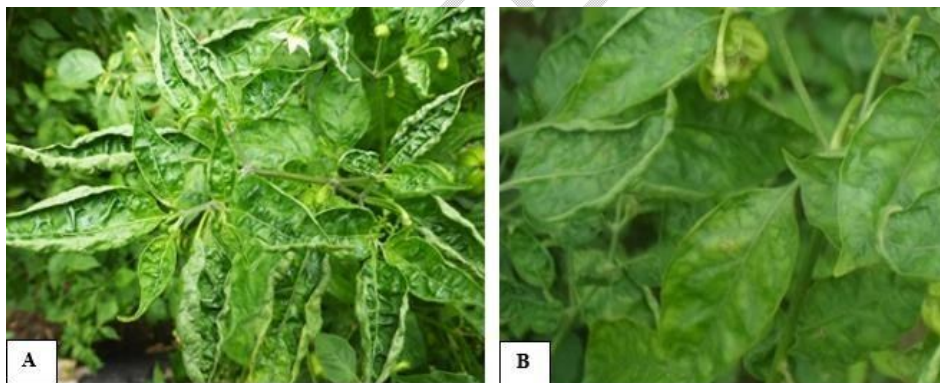
A: Sample CI 250 (mosaic + blistering) B: Sample CI 251 (interveinal discoloration + curling)