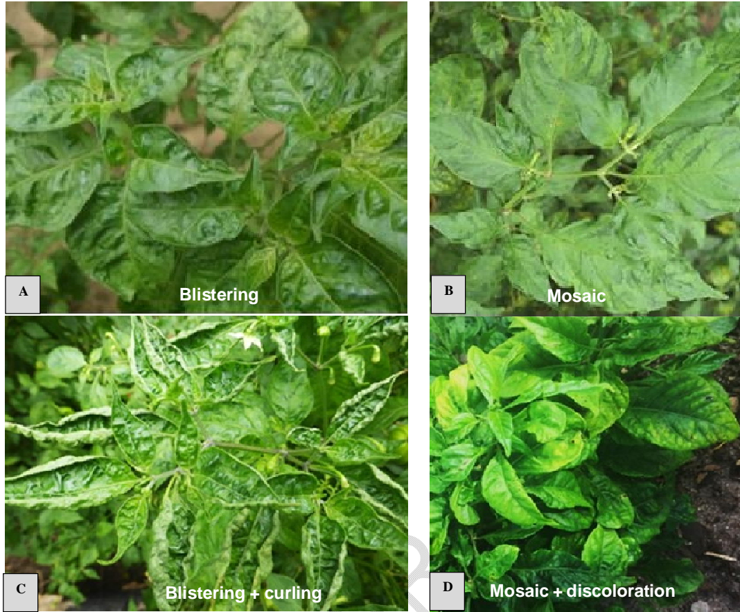
A and B: Single symptoms C and D: Complex symptoms Fig. 1. Viral disease symptoms observed in both study localities