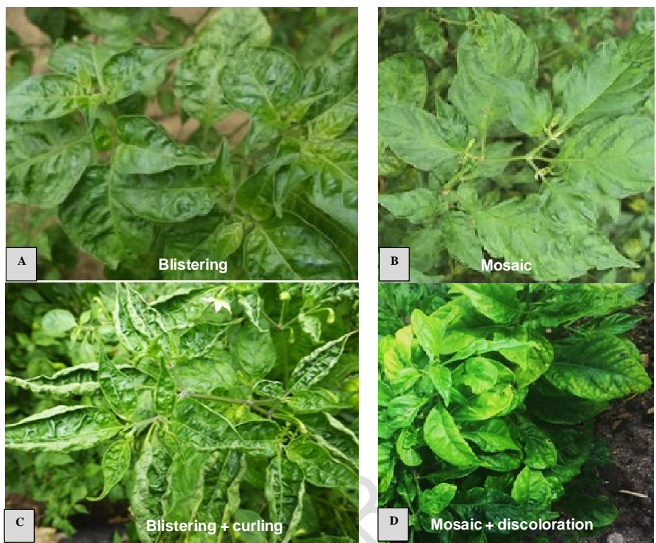
A and B: Single symptoms C and D: Complex symptoms Fig. 1. Viral disease symptoms observed in both study localities