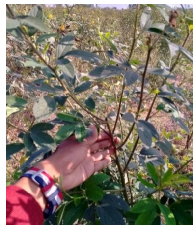
Fig 3. Increased in number of branch after pruning