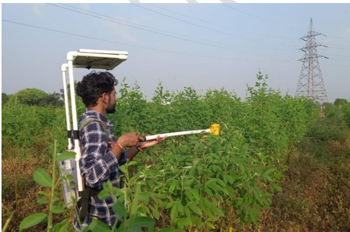
Fig 2. Pruning of pigeon pea by developed pigeon pea pruner