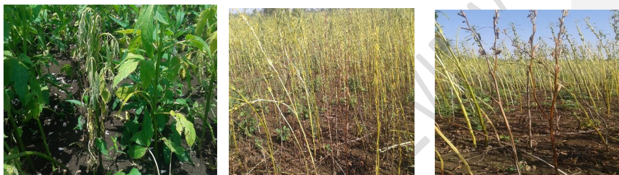
Figure 2. Fusarium wilt disease affected sesame plants in the areas surveyed.

In Tsegedie district fields in the major sesame growing areas of Danshazurya and KebaboKebelles were assessed for the disease. The lowest 0.33% mean disease incidence was observed in Danshazurya, whereas the highest mean disease incidence (19.57% ) was recorded at Kebabo. Individual farm level data indicated that disease incidence ranged from nil to 80%, with the maximum disease incidence recorded in KebaboKebelle (Table 2).