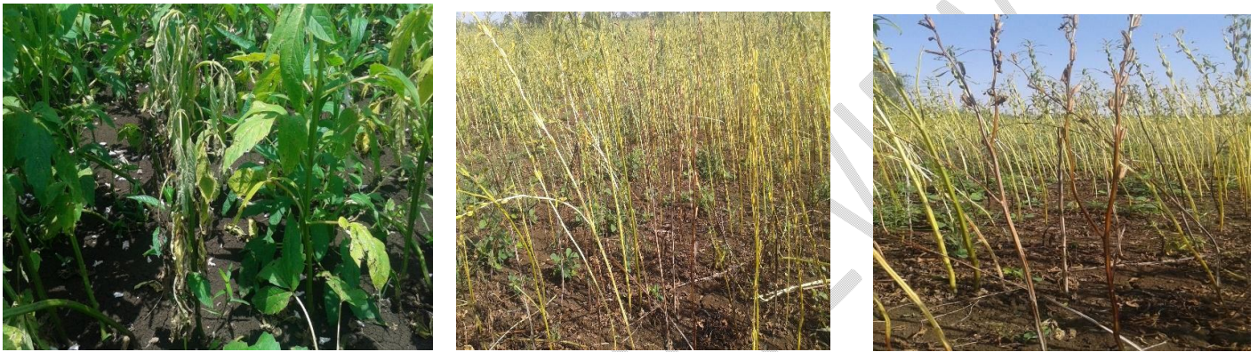
Figure 2. Fusarium wilt disease affected sesame plants in the areas surveyed.

In Tsegedie district fields in the major sesame growing areas of Dansha zurya and Kebabo kebelles were assessed for the disease. The lowest 0.33% mean disease incidence was observed in Dansha zurya, whereas the highest mean disease incidence (19.57% ) was recorded at Kebabo. Individual farm level data indicated that disease incidence ranged from nil to 80%, with the maximum disease incidence recorded in Kebabo Kebele (Table 2).