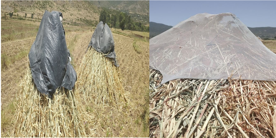
Fig. 4. Farmers covering harvested crops with plastic and nets