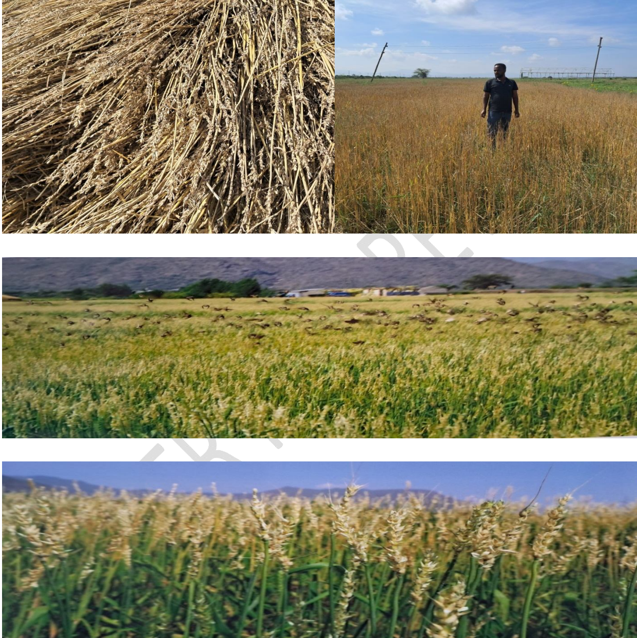
Fig.2. Incidence and severity of Queleaquelea birds on the crop field.

loss of crop yield due to birds is a significant concern for farmers across the country. Birds such as sparrows, crows, and parrots can cause substantial damage to crops, leading to economic losses for farmers.