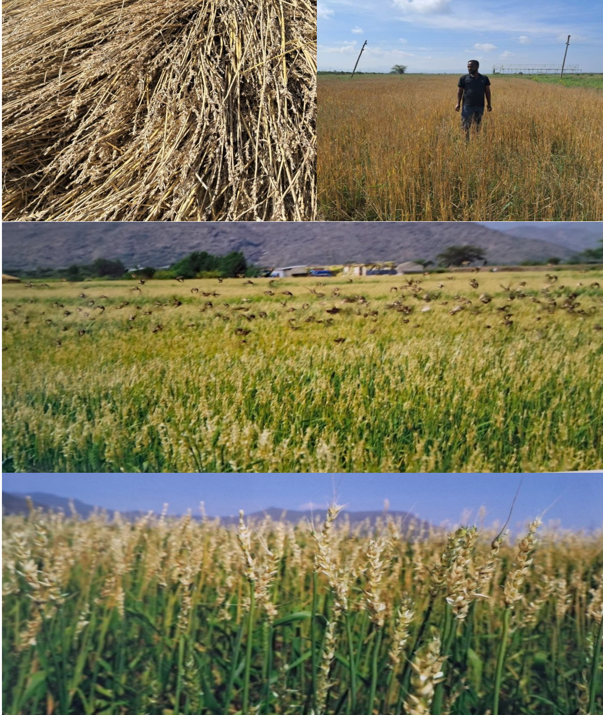
Fig.1. Yild losses (damage) due to Quelea birds in the farmers field

Table 1. ANOVA results of kebelles, crop types, planting time, and harvesting time, source of water and coverage of tree on bird damage (yield losses).