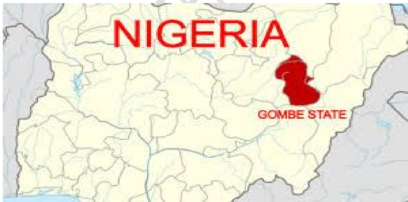
Figure 1: Map of Nigeria showing the location of the study area

The study was conducted at the central abattoir of Gombe metropolis located in the North East region of the Country. The abattoir is the major abattoir in Gombe metropolis slaughtering an average of 100% cattle a day. Gombe State is located between latitudes 10°16', and 6°00'N and longitude 11°09'E. The climate of Gombe is characterized by a cool dry (Harmattan) season with minimum temperature of about 23.48°C from December to February, a hot dry season with annual maximum temperature of about 35.39°C from March- May and warm wet season from June September, a less marked season after rains during the months of October to November, characterized by decreased rainfall and gradual lowering of temperature [15]. Gombe State has two main vegetation zones. The Guinea savannah zone in the southern part of the State and the Sudan savannah zone in the northern part (Figure 1).