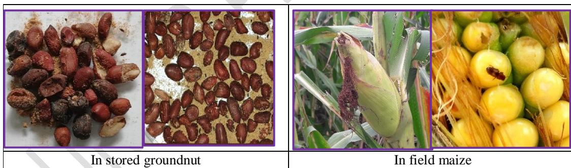
Fig. 2. Damage caused by Carpophilus dimidiatus

In storage, both the grubs and adults damage the groundnut seeds. These bore the seeds and the bore holes are prominently visible. In case of excessive damage, only shells are left and internal content of the seed is converted into a powdery mass.