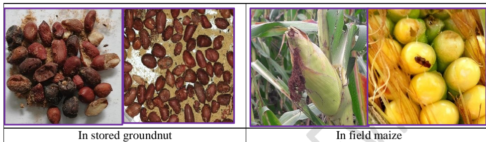
Fig. 2. Damage caused by Carpophilus dimidiatus

In storage, both the grubs and adults damage the groundnut seeds. These bore the seeds and the bore holes are prominently visible. In case of excessive damage, only shells are left and internal content of the seed is converted into powdery mass.