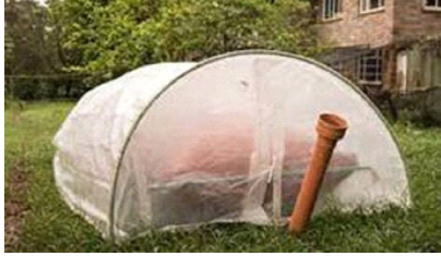
Figure 2. Flexi bio digester

envelope made of PVC canvas, housed in a fabric tunnel.[46].